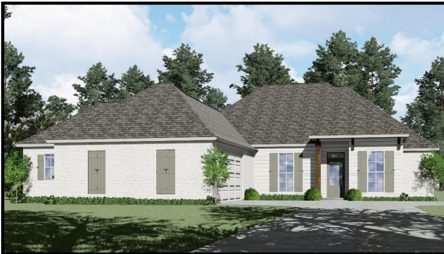
Front Elevation I