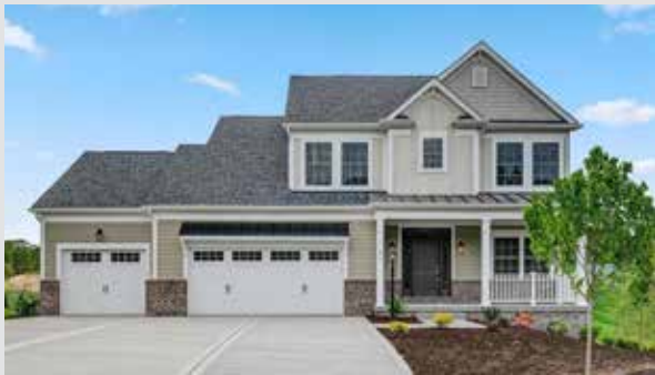
Easton Starting at $550,000 3-4 Beds | 2 Stories | 2.5 Baths | 2 Car Garage 2,228 Sq. Ft. First Floor Master BR

Our open concept floorplans, including first floor master options, offer plenty of square footage that can be personalized to make each of our homes truly unique to their owners.