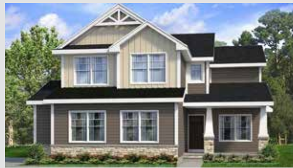
Lancaster Starting at $530,000 4 Beds | 2 Stories | 2.5 Baths | 2 Car Garage 2,077 Sq. Ft.