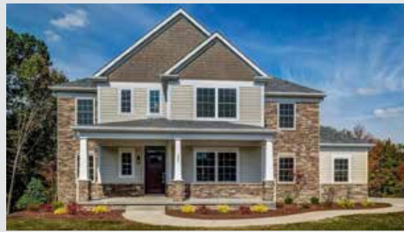
Summerfield Starting at $630,000 5 Beds | 2 Stories | 3.5 Baths | 3 Car Garage 3,156 Sq. Ft.