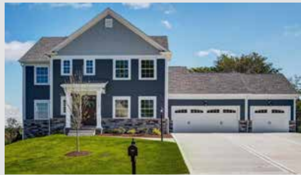
Heatherfield Starting at $579,000 4 Beds | 2 Stories | 2.5 Baths | 2 Car Garage 2,660 Sq. Ft.