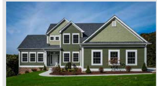
Fulton Starting at $570,000 4 Beds | 2 Stories | 2.5 Baths | 2 Car Garage 2,250 Sq. Ft. First Floor Master BR