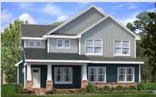
Clifton Starting at $550,000 4 Beds | 2 Stories | 2.5 Baths | 2 Car Garage 2,331 Sq. Ft.