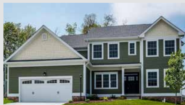
Barclay Starting at $560,000 4 Beds | 2 Stories | 2.5 Baths | 2 Car Garage 2,400 Sq. Ft.