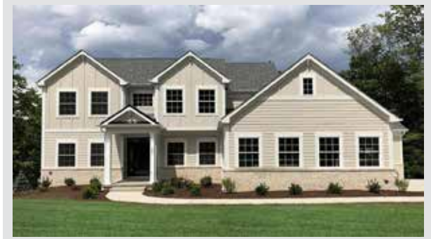
Townsend Starting at $615,000 4 Beds | 2 Stories | 2.5 Baths | 2 Car Garage 2,725 Sq. Ft. First Floor Master BR