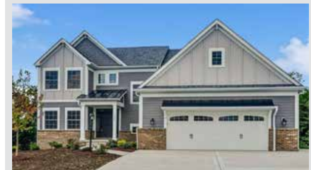
Harrison Starting at $565,000 4 Beds | 2 Stories | 2.5 Baths | 2 Car Garage 2,413 Sq. Ft.