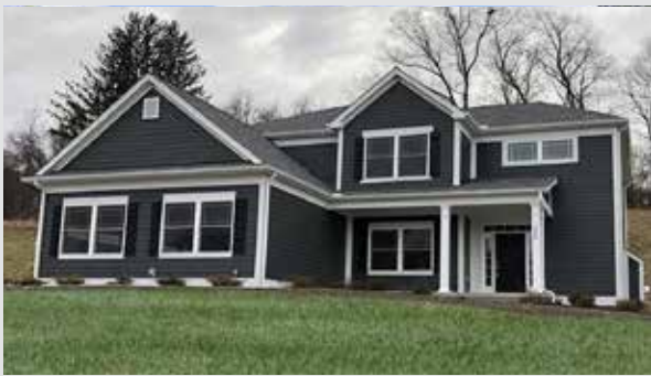
Millcreek Starting at $575,000 4 Beds | 2 Stories | 2.5 Baths | 2 Car Garage 2,648 Sq. Ft.