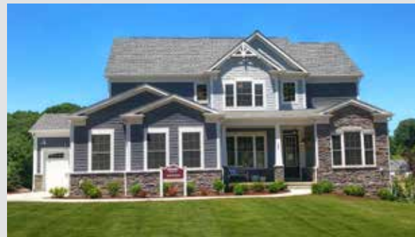
Ashton Starting at $589,000 4 Beds | 2 Stories | 2.5 Baths | 2 Car Garage 2,820 Sq. Ft.