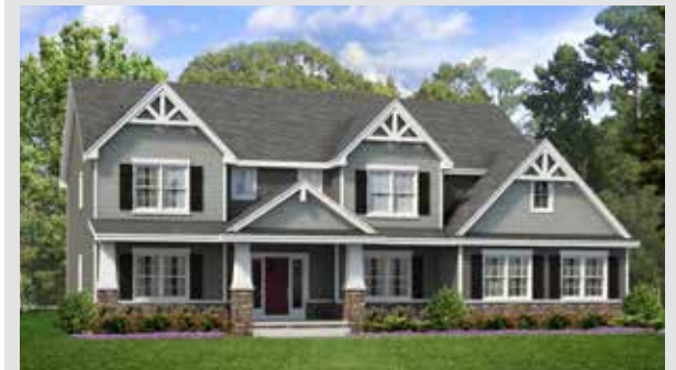
Grayson Starting at $720,000 4-6 Beds | 2 Stories | 3.5 Baths | 3 Car Garage 3,803 Sq. Ft.