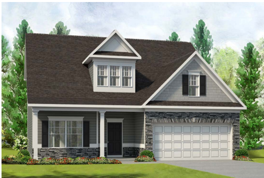
Elevation E / CF-5A