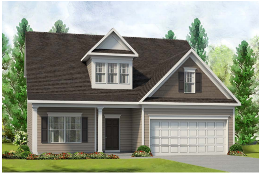
Elevation B / CF-1A