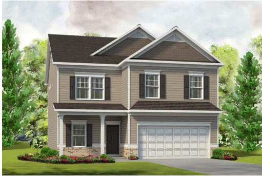
Elevation A / CF-1B