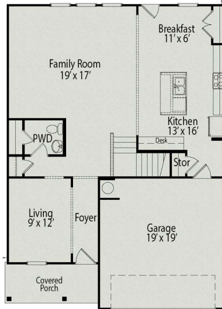
First Floor - A