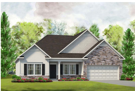
Elevation F / CF-14B