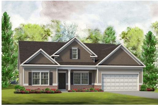
Elevation B / CF-1A