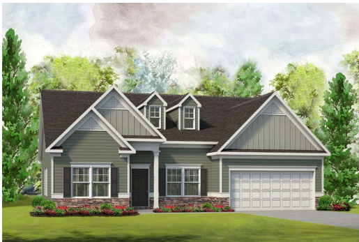
Elevation D / CF-10A