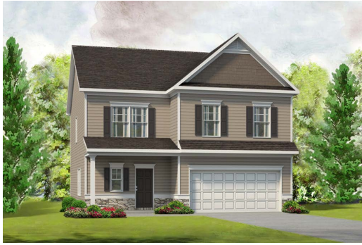
Elevation A / CF-1A