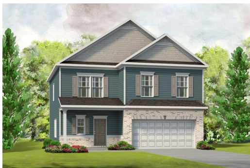
Elevation C / CF-12A