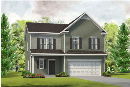
Elevation B / CF-10A