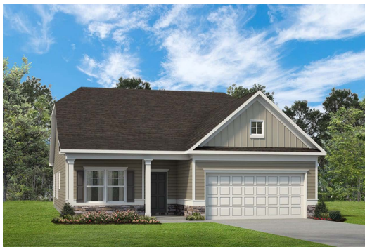
Elevation C / CF-3A