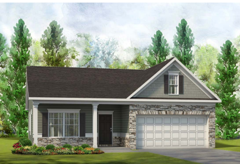
Elevation D / CF-10B