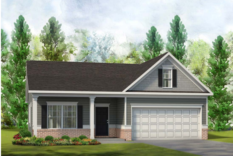
Elevation A / CF-5A