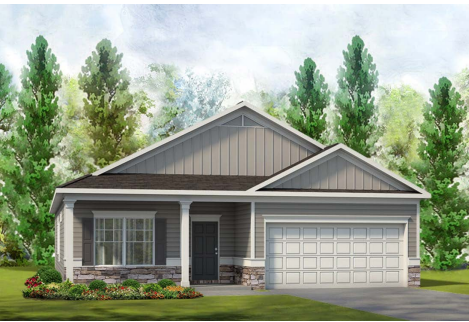
Elevation B / CF-9B