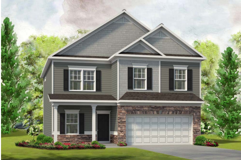
Elevation B / CF-5B