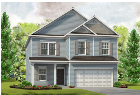
Elevation E / CF-16A