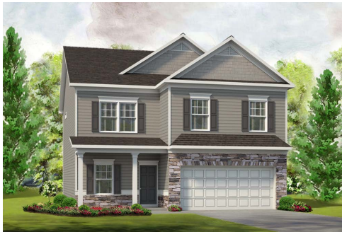
Elevation D / CF-9B