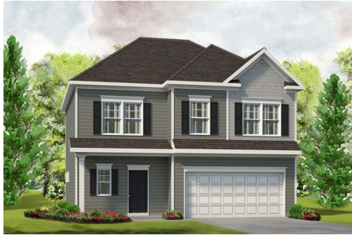
Elevation C / CF-5A