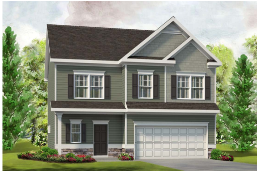
Elevation D / CF-10A