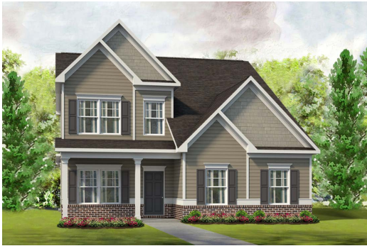
Elevation A / CF-3B

Alley Load 3 Beds / 2.5 Baths 2,131 Sq.Ft.