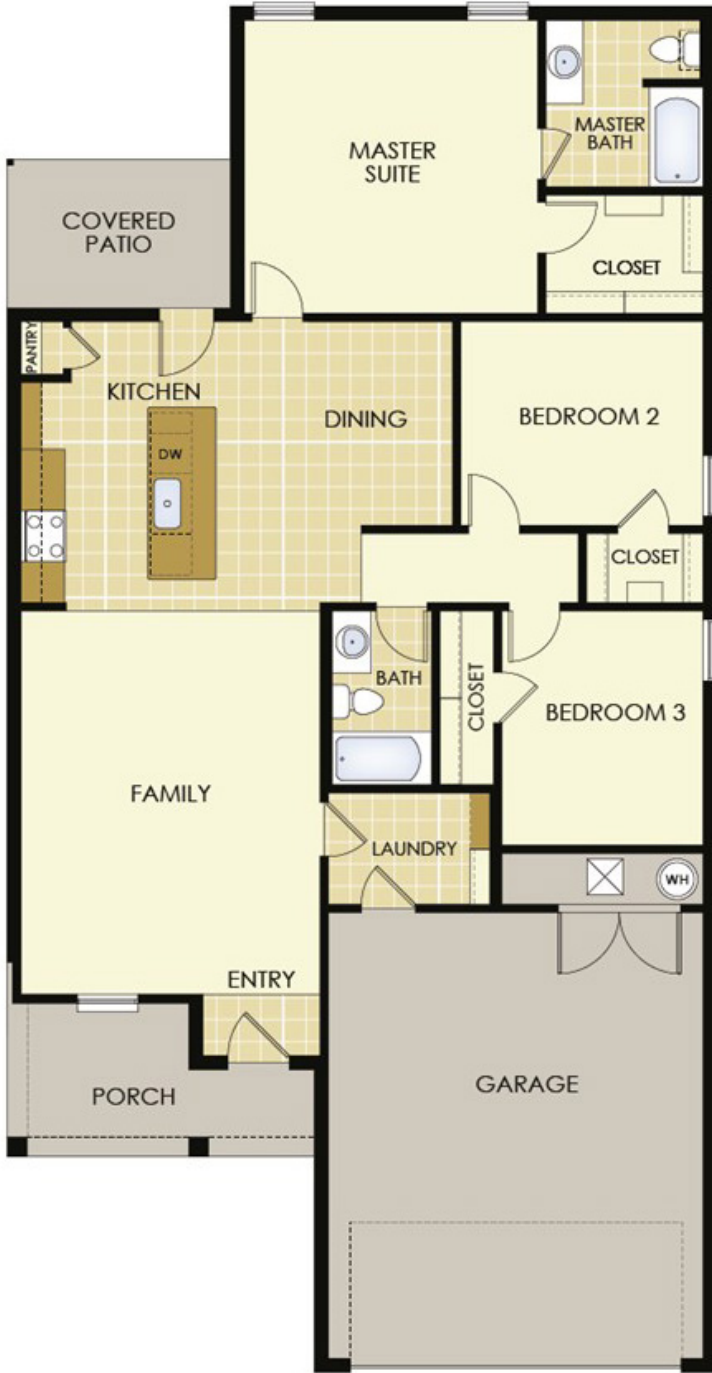
Kenlie Front Elevation