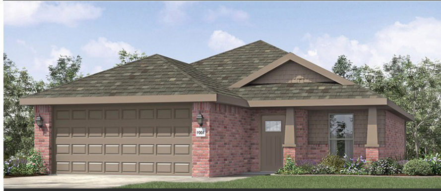
1450KB Series | Nancy