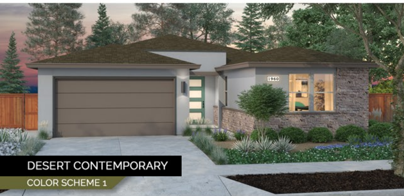
DESERT CONTEMPORARY COLOR SCHEME 1