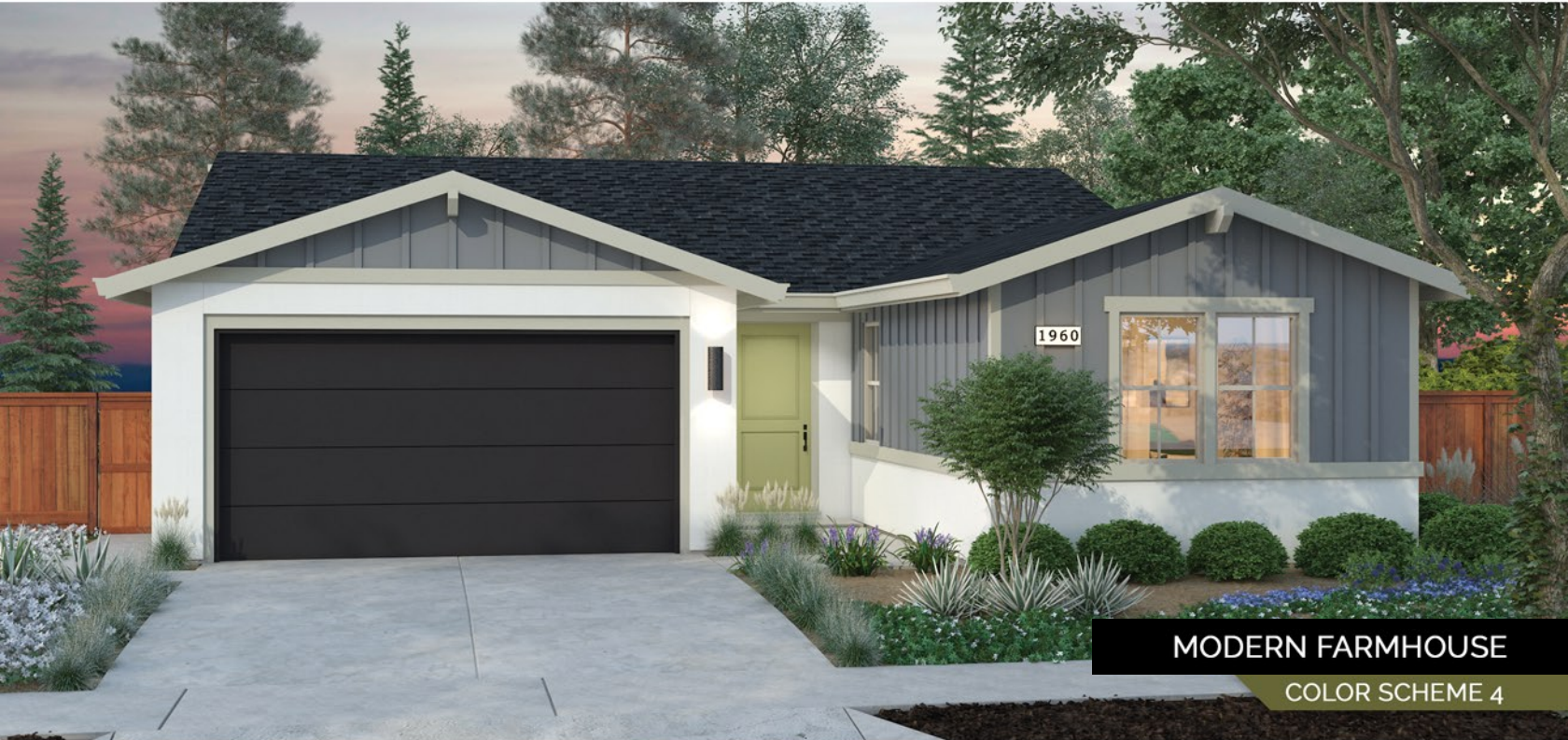
MODERN FARMHOUSE COLOR SCHEME 4