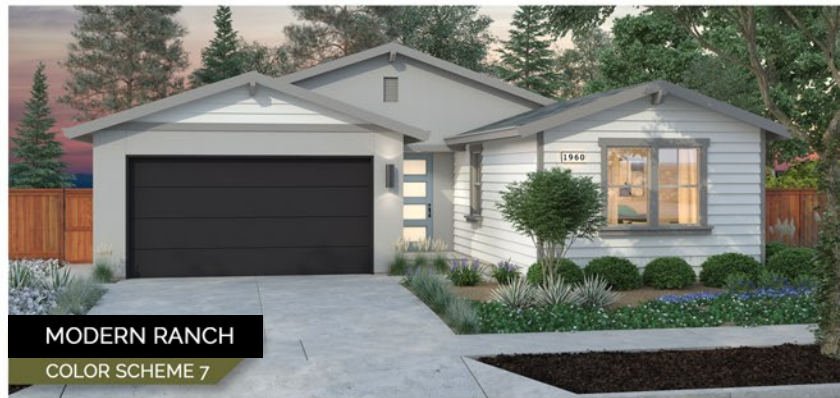
MODERN RANCH COLOR SCHEME 7