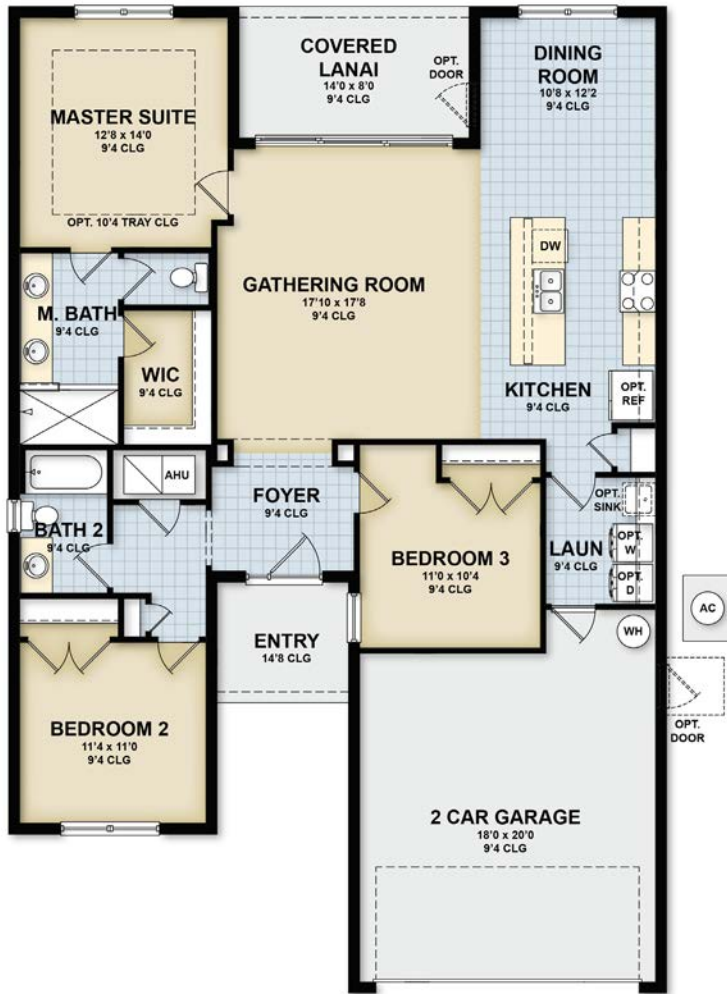
ELEVATION A & B