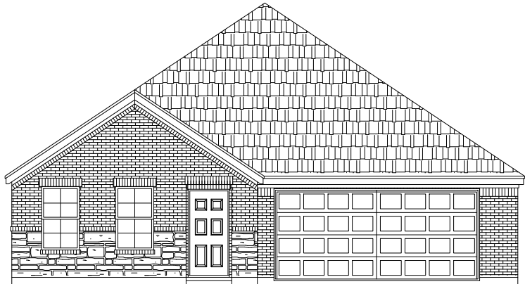
Elevation C * Opt. 8:12 Roof