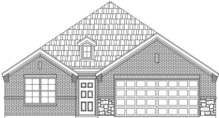
Elevation A * Opt. 8:12 Roof