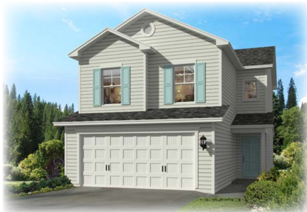
FRONT ELEVATION D