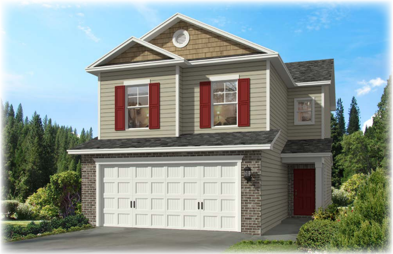
FRONT ELEVATION F