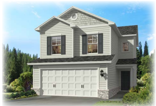
FRONT ELEVATION E