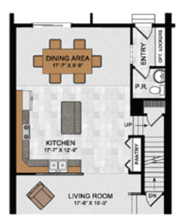
OPTIONAL FIRST FLOOR PLAN