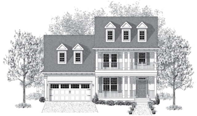
ELEVATION C BO-C-OR-1653

Shown with optional: 10 foot first floor wall height, main gable and dormer decorative brackets, main gable window, craftsman windows, craftsman tapered columns with stone piers, dormer over garage, porch railing, shutter dogs and hinges