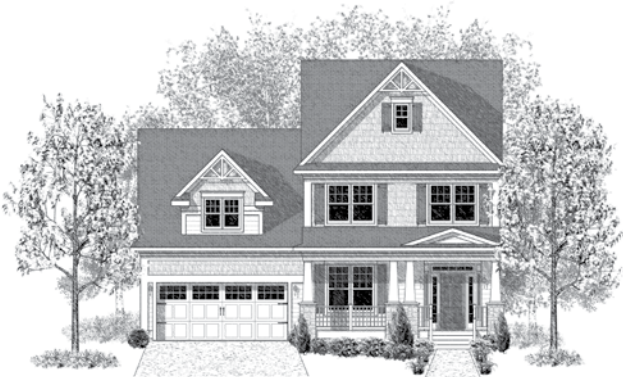
ELEVATION B BO-B-OR-1652

Shown with optional: 10 foot first floor wall height, dormer main house, eave and gable brackets porch railing, dormer over garage, shutter dogs and hinges