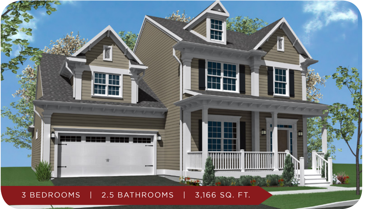
ELEVATION A BO-A-OR-1651

Shown with optional: 10 foot first floor wall height, dormer main house, eave and gable brackets porch railing, dormer over garage, shutter dogs and hinges