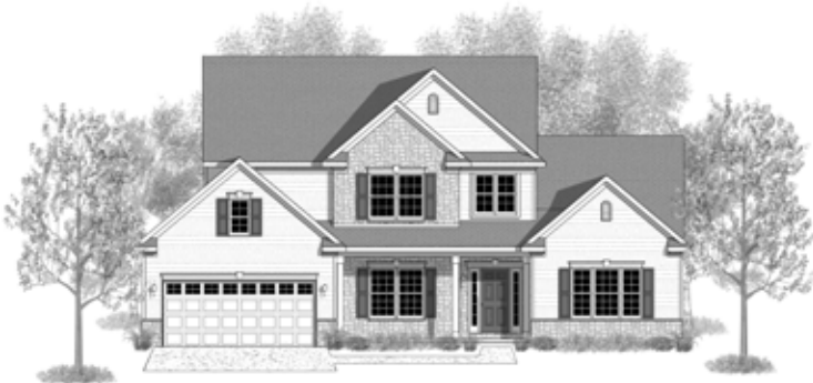
ELEVATION A WB-A-OR-2400

Shown with optional: 9 foot first floor ceilings, garage gable window with 6" wrap and header, 8" square porch posts, porch post brackets, porch railing, craftsman style windows, upgraded window color, newport style garage door, 2 single gable dormers