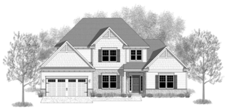
ELEVATION C WB-C-OR-2402

Shown with optional: 9 foot first floor ceilings, garage gable window with shutters and header, 8" square porch posts, garage door with windows