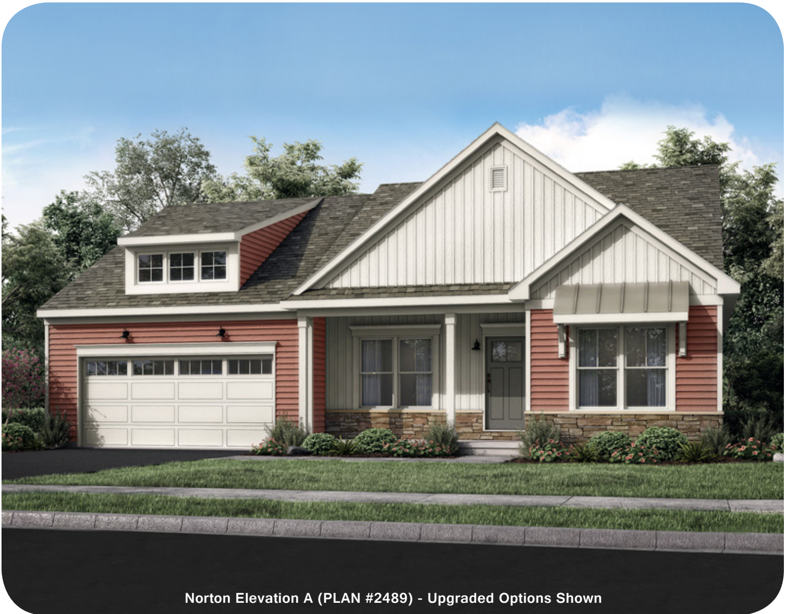
Norton Elevation A (PLAN #2489) - Upgraded Options Shown