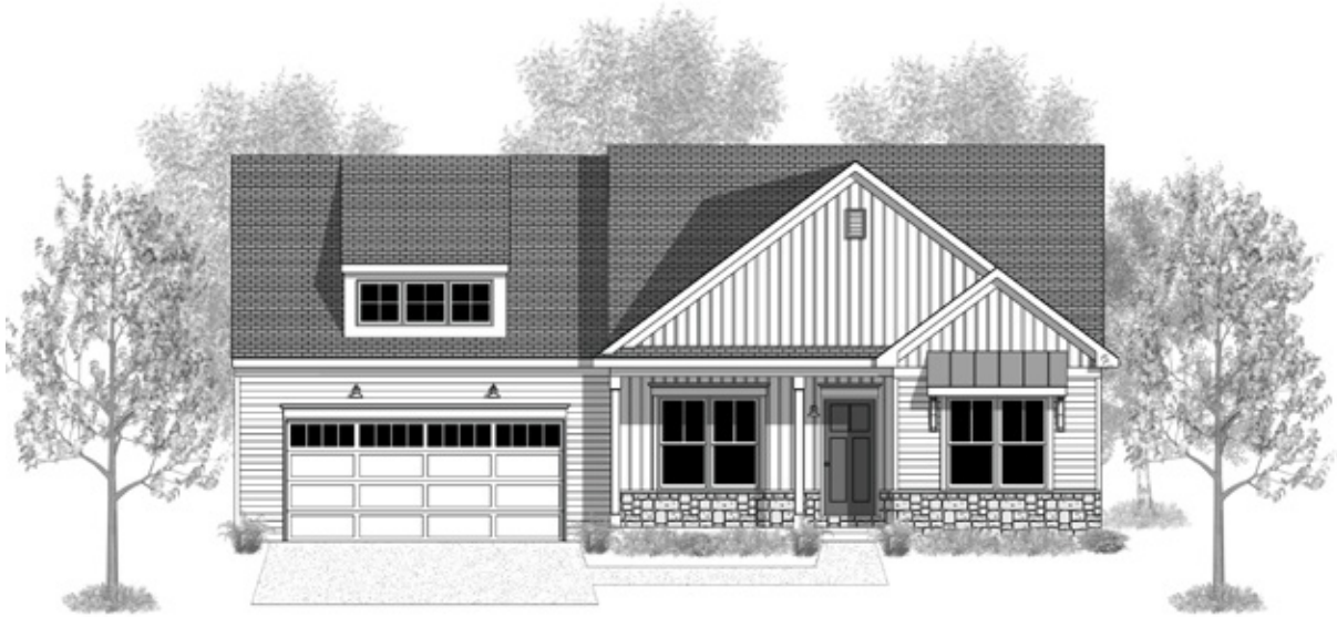
UPGRADED OPTIONAL ELEVATION A