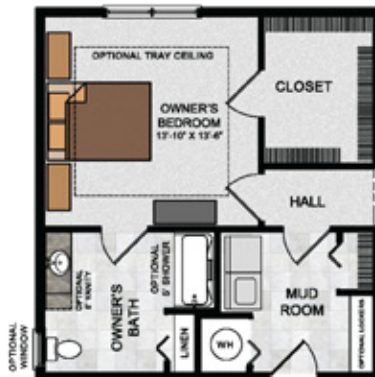
FIRST FLOOR PLAN WITH SLAB ON GRADE