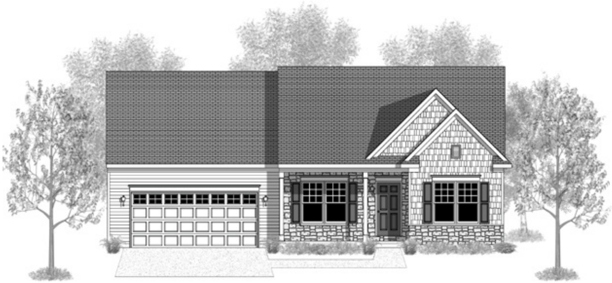
UPGRADED BASE ELEVATION