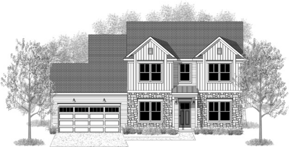
UPGRADED OPTIONAL ELEVATION A