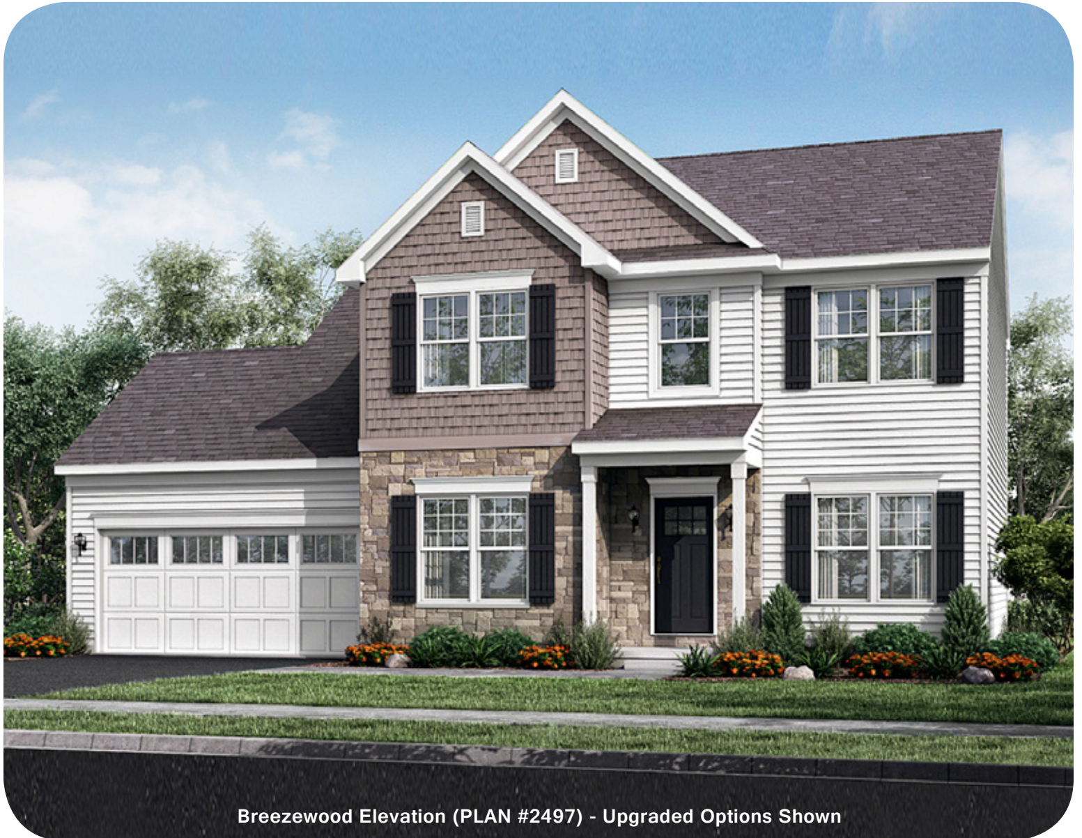
Breezewood Elevation (PLAN #2497) - Upgraded Options Shown