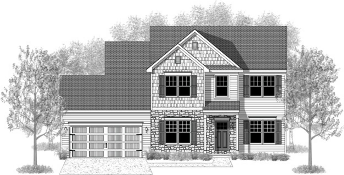
UPGRADED BASE ELEVATION