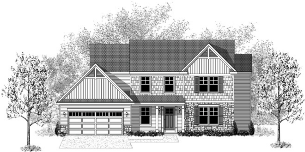
UPGRADED OPTIONAL ELEVATION A