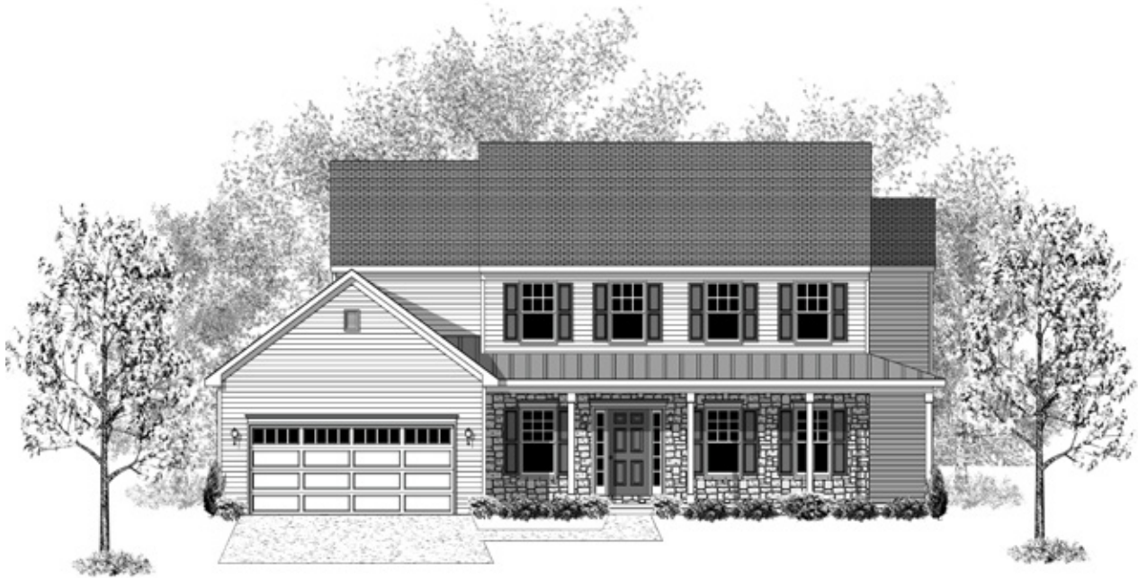
UPGRADED BASE ELEVATION