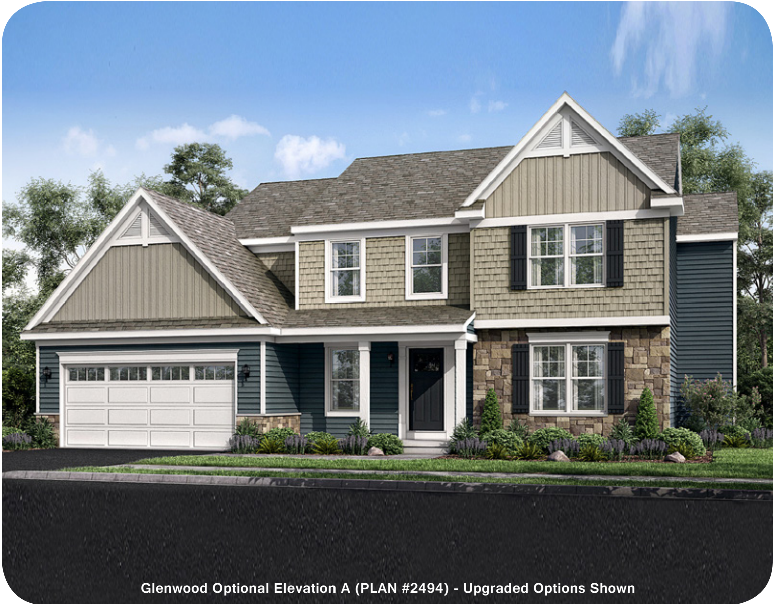
Glenwood Optional Elevation A (PLAN #2494) - Upgraded Options Shown