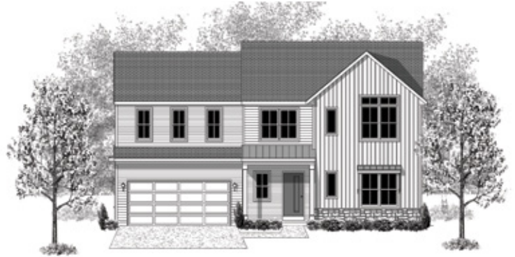
UPGRADED OPTIONAL ELEVATION C