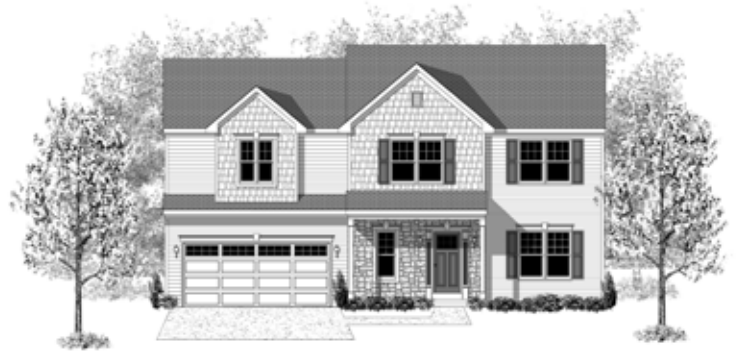
UPGRADED OPTIONAL ELEVATION A