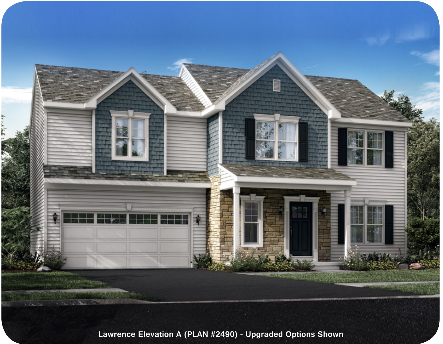
Lawrence Elevation A (PLAN #2490) - Upgraded Options Shown