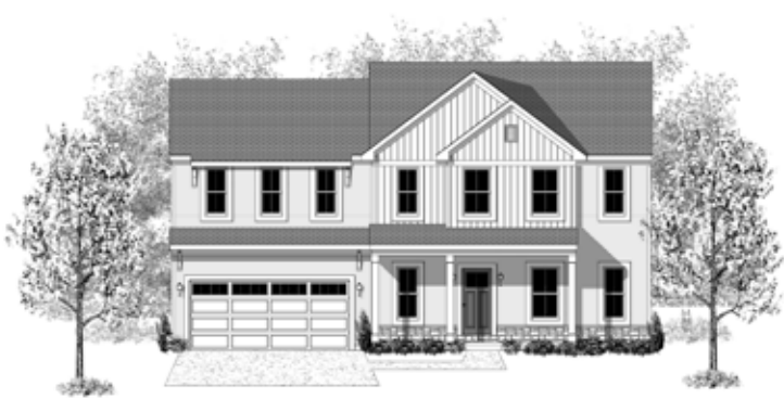
UPGRADED OPTIONAL ELEVATION B