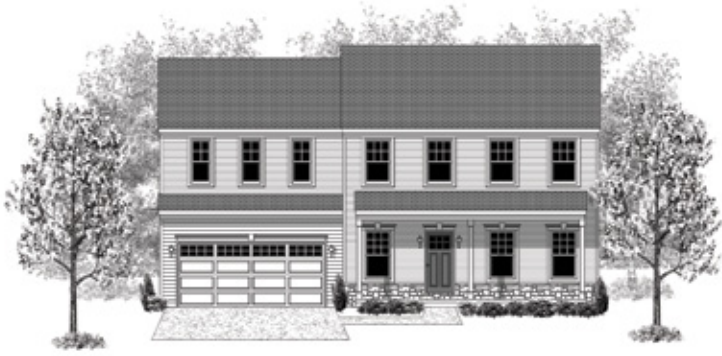
UPGRADED BASE ELEVATION