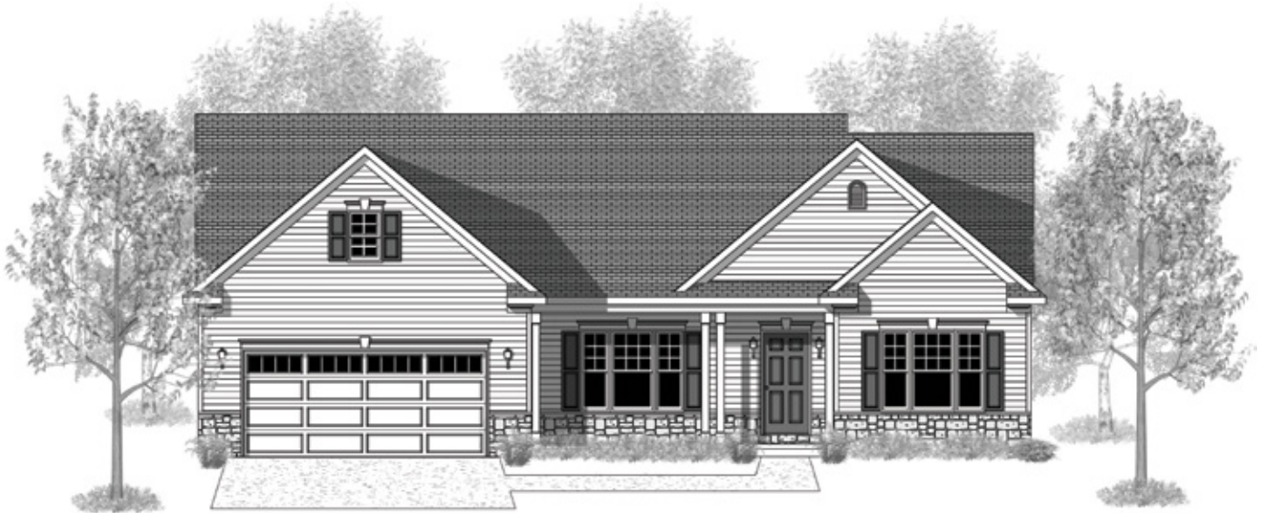
UPGRADED OPTIONAL ELEVATION B