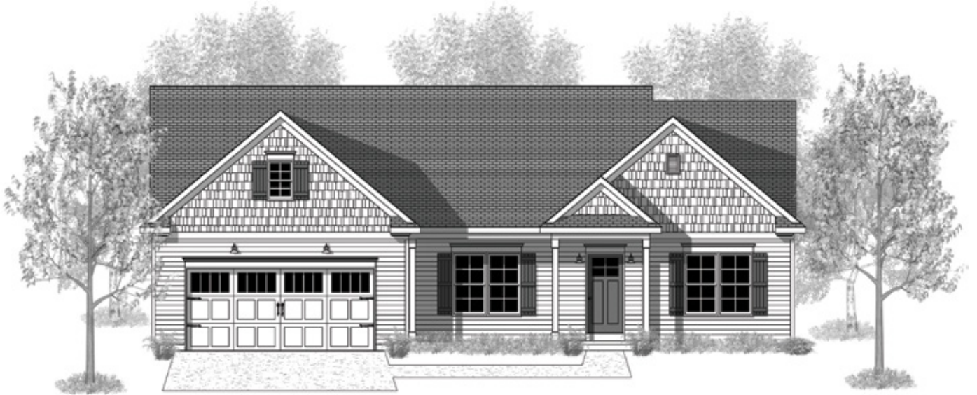
UPGRADED OPTIONAL ELEVATION A