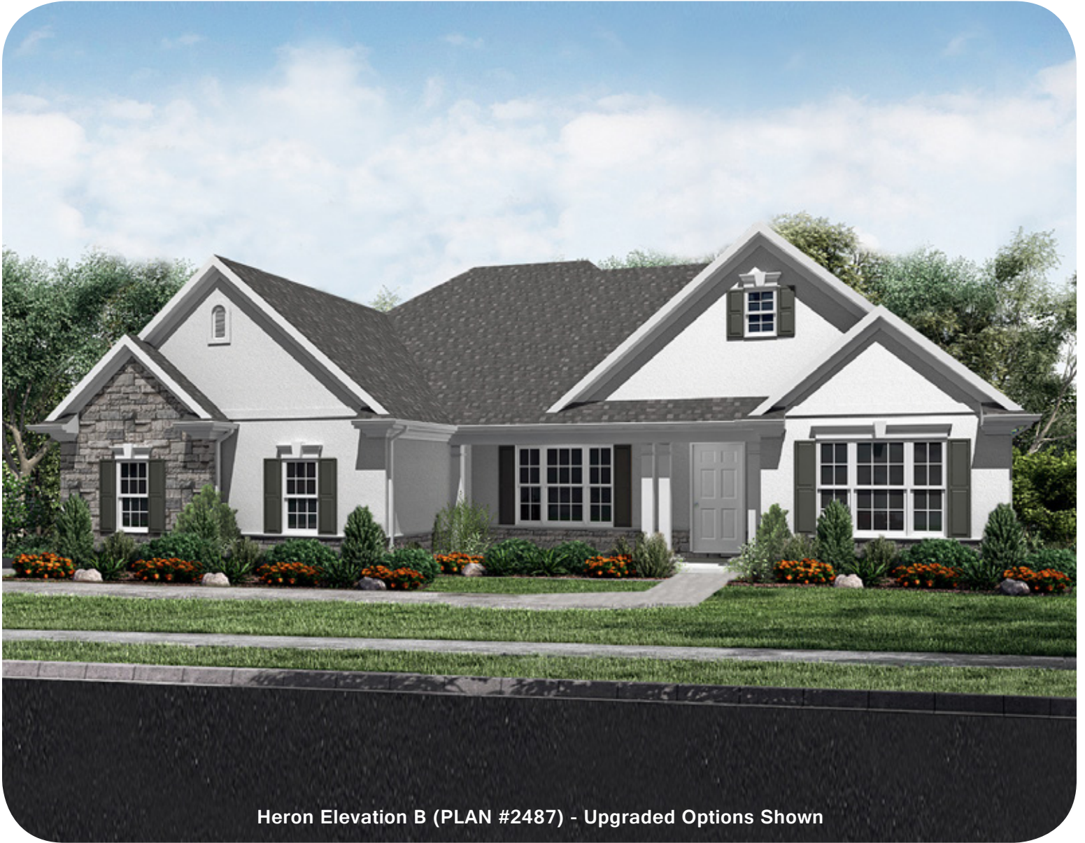
Heron Elevation B (PLAN #2487) - Upgraded Options Shown