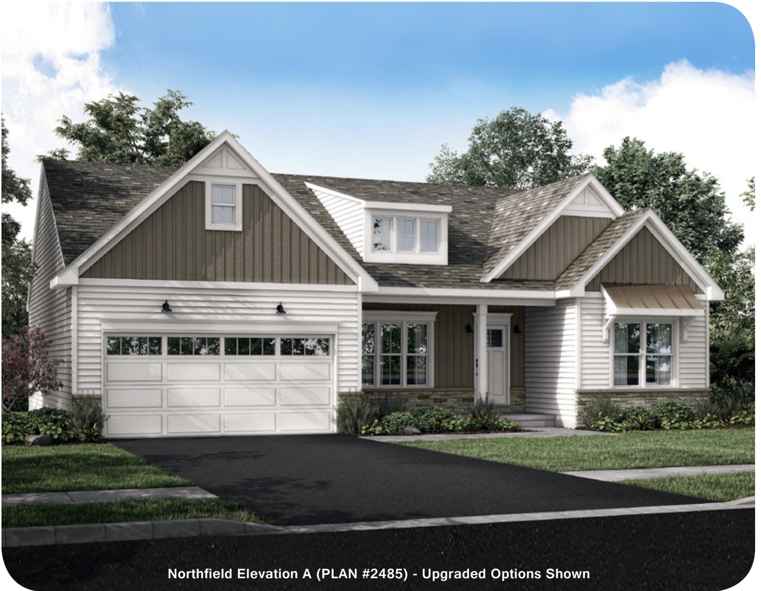
Northfield Elevation A (PLAN #2485) - Upgraded Options Shown