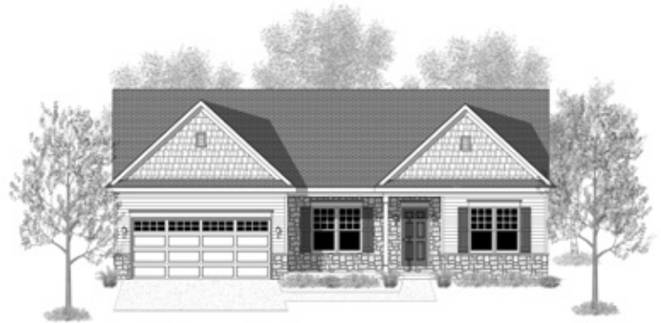
UPGRADED OPTIONAL ELEVATION B