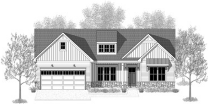
UPGRADED OPTIONAL ELEVATION A