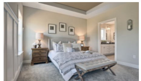
Above Photos: Upgraded Optional Elevation A (SB-167) - Upgraded options are shown including but not limited to ceilings, extensions, fireplace, lockers, and windows.