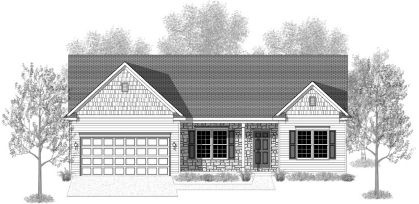
UPGRADED BASE ELEVATION