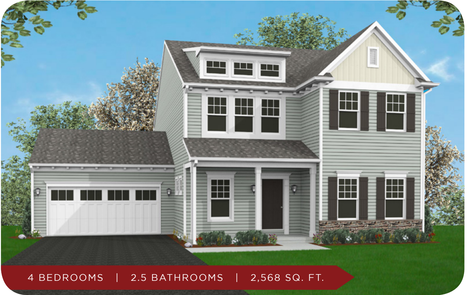
ELEVATION A ES-A-OR-2360

Shown with optional: 9 foot first floor ceilings, triple shed dormer, craftsman style windows, windows on side of study, Newport garage door, eave dentil blocks, trim around gable louver, sill-height stone on front of flex space, board and batton shutters, additional light at front door and garage door