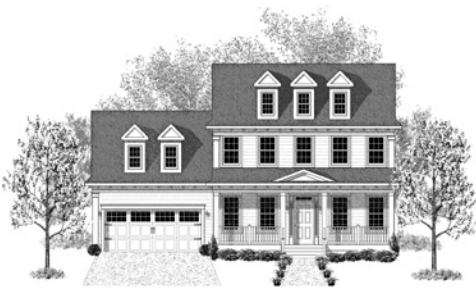
ELEVATION A BH-A-OR-1581

Shown with optional: 10 foot first floor wall height, main gable and garage dormer decorative brackets, garage dormer, craftsman windows, eave brackets, craftsman tapered columns with stone piers, porch railing, standing seam porch roof