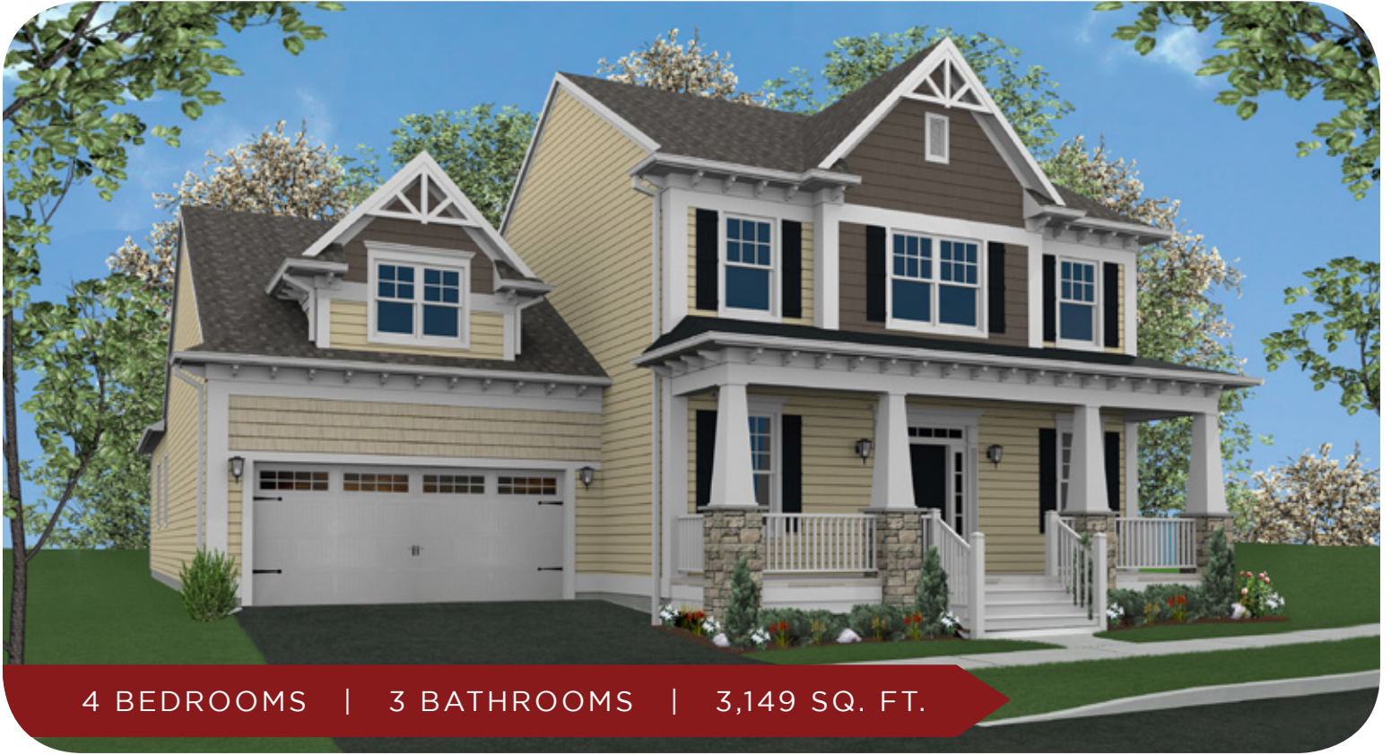
ELEVATION B BH-B-OR-1582

Shown with optional: 10 foot first floor wall height, main gable and garage dormer decorative brackets, garage dormer, craftsman windows, eave brackets, craftsman tapered columns with stone piers, porch railing, standing seam porch roof