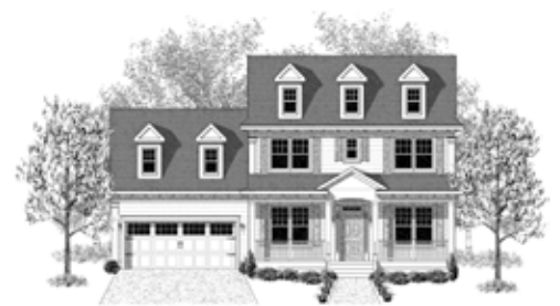
ELEVATION D BH-D-OR-1584

Shown with optional: 10 foot first floor wall height, main gable window, eave and gable brackets, first floor porch railing