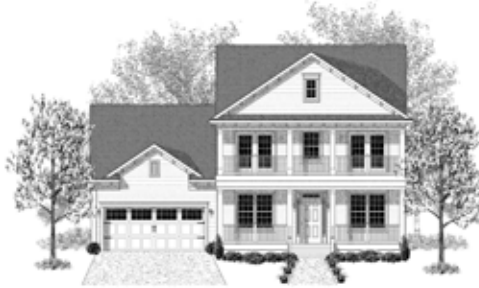
ELEVATION C BH-C-OR-1583

Shown with optional: 10 foot first floor wall height, 5 dormers, eave brackets, porch railing