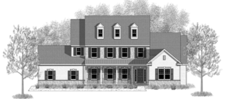
ELEVATION B KS-B-OR-2421

Shown with optional: 9' first floor ceilings, window ILO gable vent, 8" round porch posts and window in garage doors