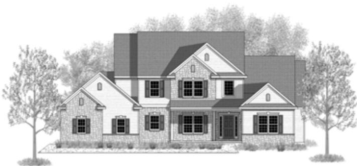
ELEVATION A KS-A-OR-2420

Shown with optional: 9' first floor ceilings, side-load garage, garage bumpout, cathedral ceiling in study, upgraded windows in study, window ILO gable vent, tapered craftsman porch posts with stone piers, newport garage doors and reverse gable brackets