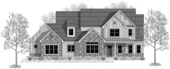
UPGRADED OPTIONAL ELEVATION A