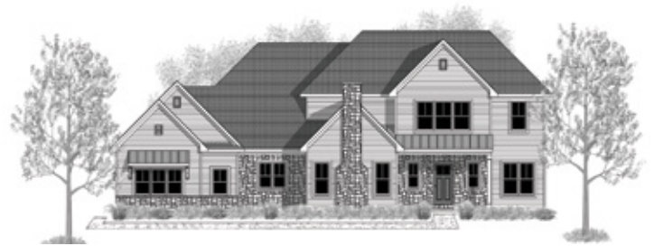
UPGRADED OPTIONAL ELEVATION B