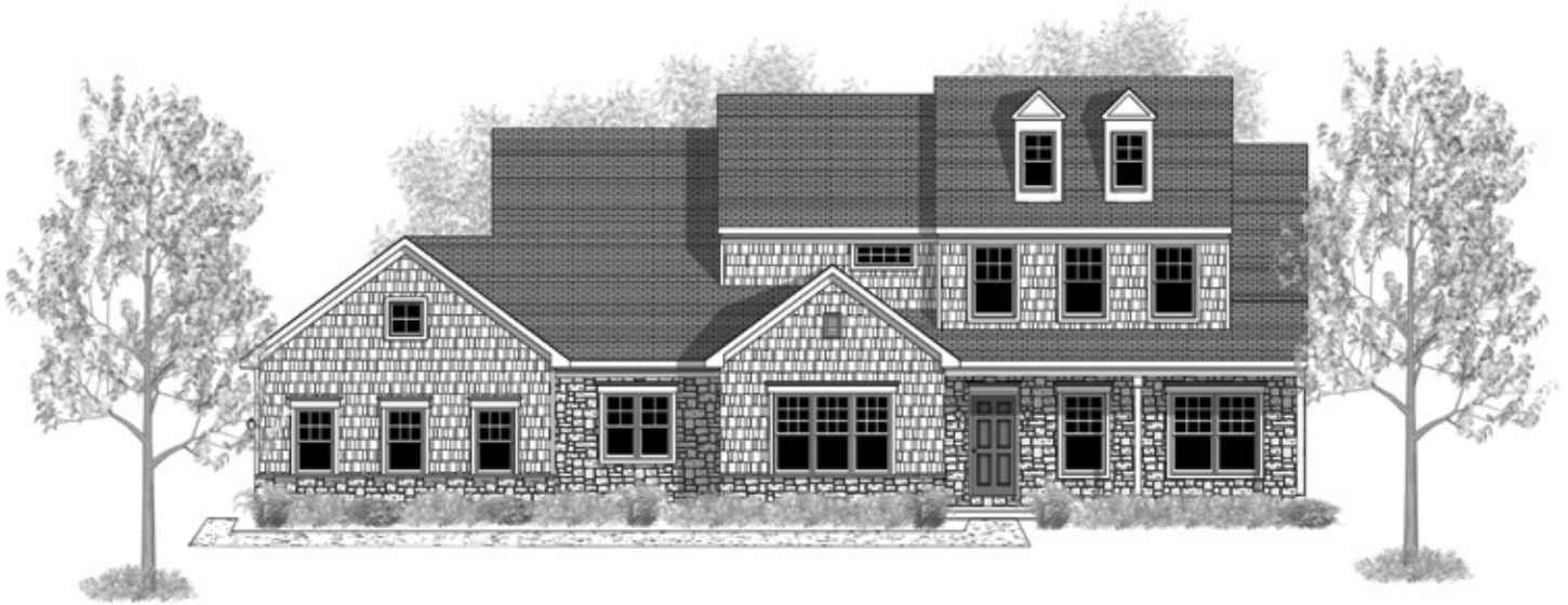
UPGRADED BASE ELEVATION