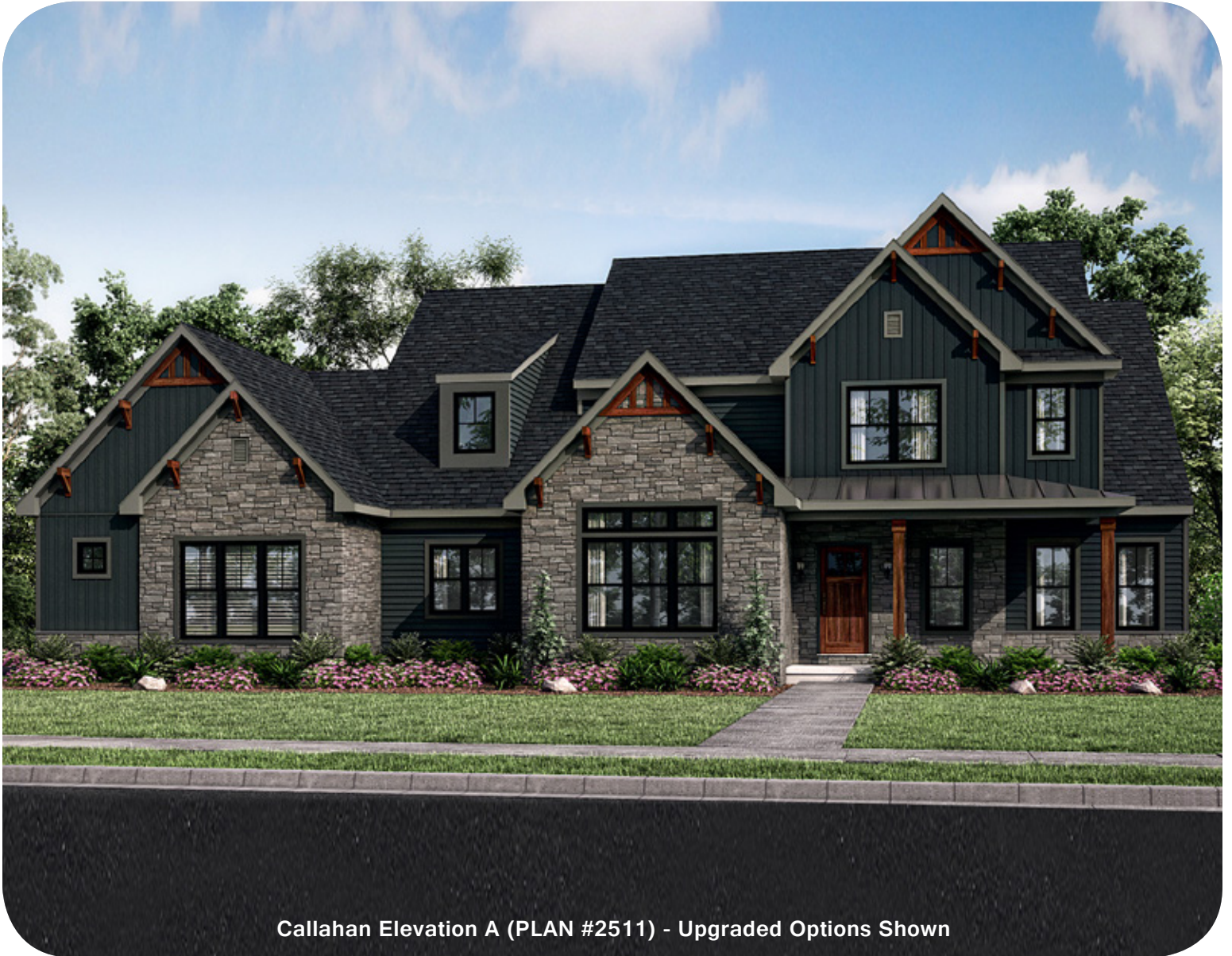
Callahan Elevation A (PLAN #2511) - Upgraded Options Shown