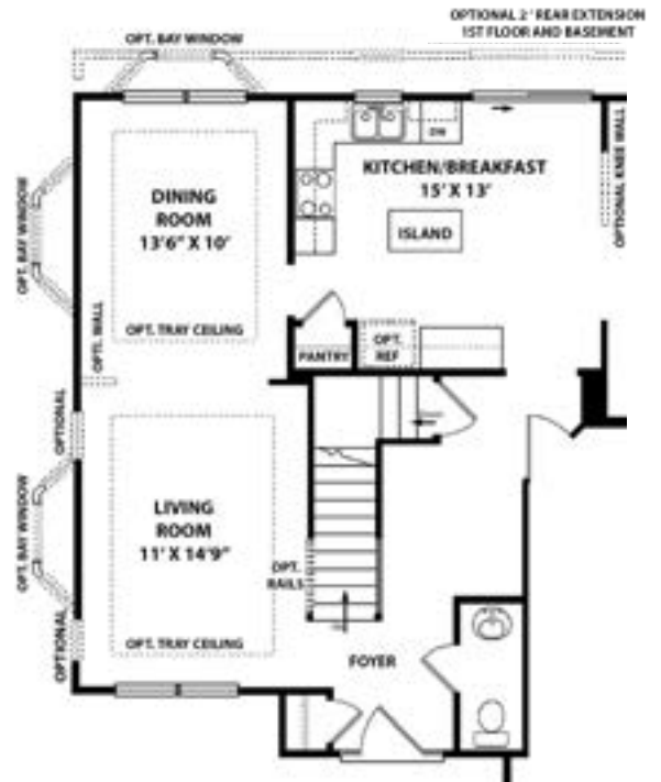
ALT. FIRST FLOOR W/ LIVING ROOM AND DINING ROOM