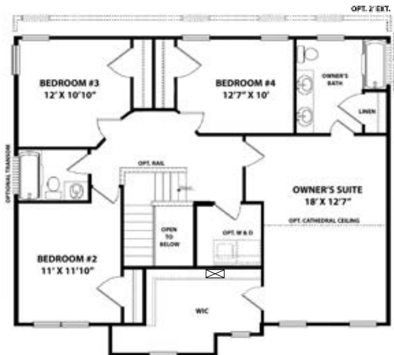
SECOND FLOOR ELEVATION 3 & 4