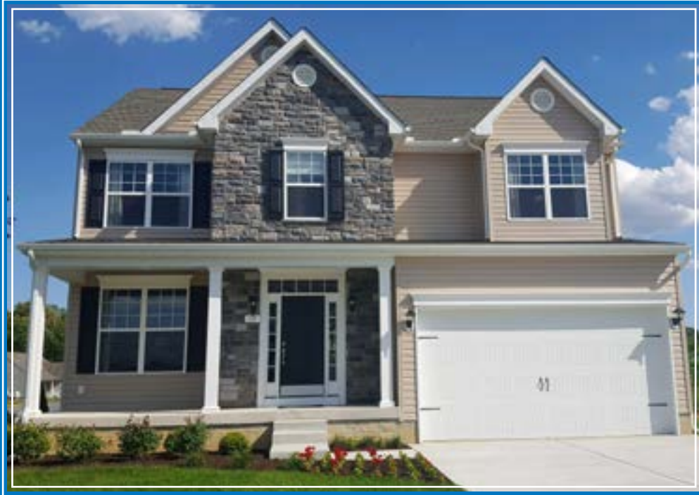
Elevation 1 Shown w/ Optional Features