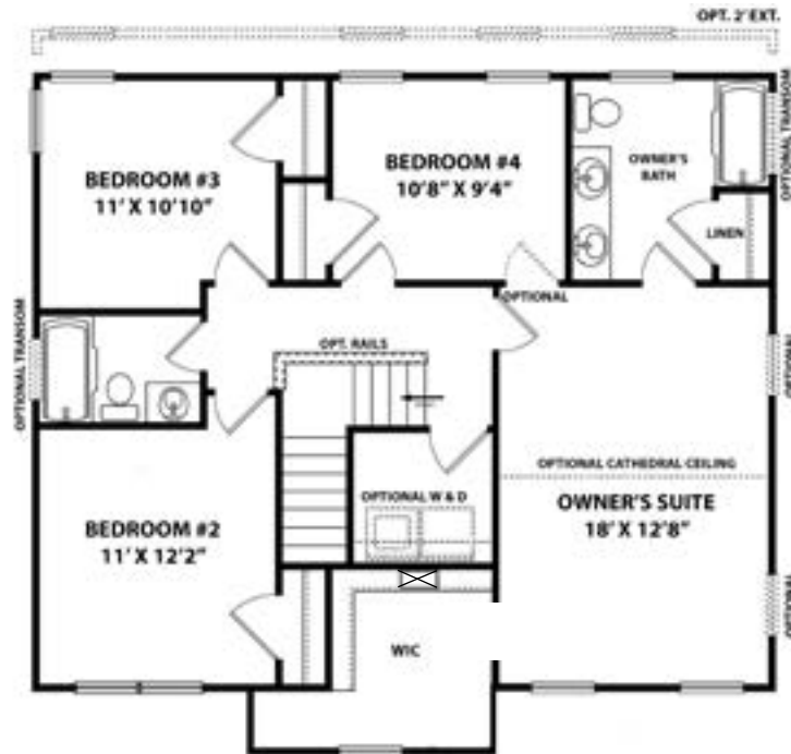
SECOND FLOOR ELEVATION 1 & 2