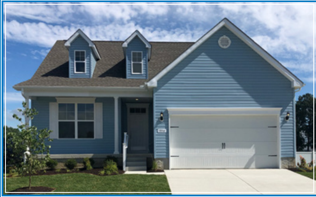
Elevation 2 w/ Optional Dormers