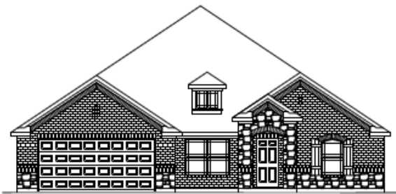
Front Elevation w/Optional Stone