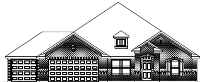
Front Elevation w/Optional 3-Car Garage

Prices, plans, dimensions, features, specification, materials and availability of homes or communities are subject to change without notice or obligation. Illustrations are artist depictions only and may differ from completed improvements. Not all options available in all communities. All Rights Reserved.