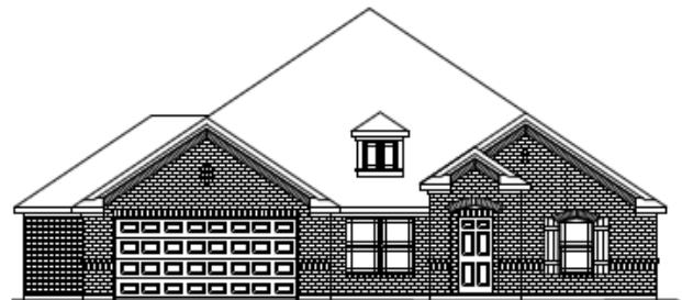
Front Elevation w/Optional 5' Extension