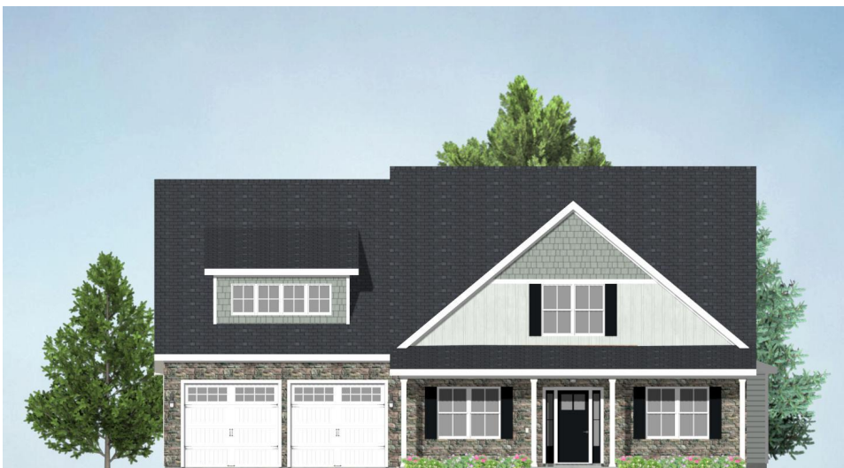
ELEVATION C **WHERE STONE IS INDICATED IN ILLUSTRATION, BRICK IS INCLUDED. HOWEVER, STONE MAY BE SELECTED FOR AN ADDITIONAL CHARGE.