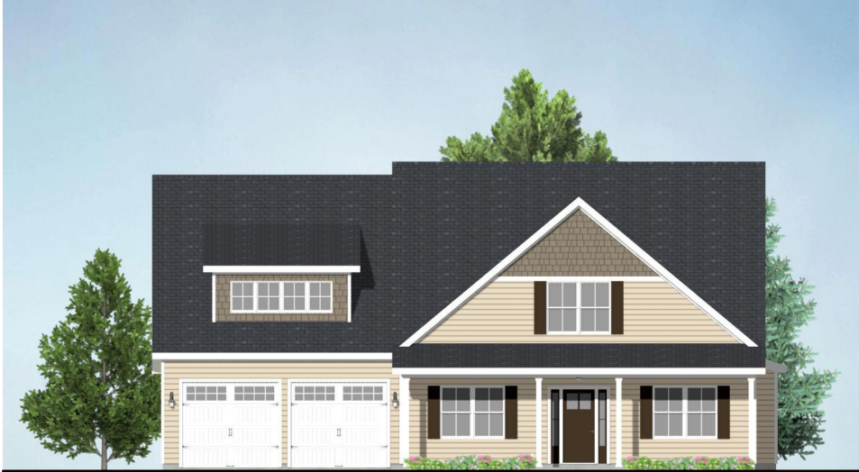
ELEVATION A ** SHAKE IS NOT INCLUDED IN SILVER PACKAGE NEIGHBORHOODS