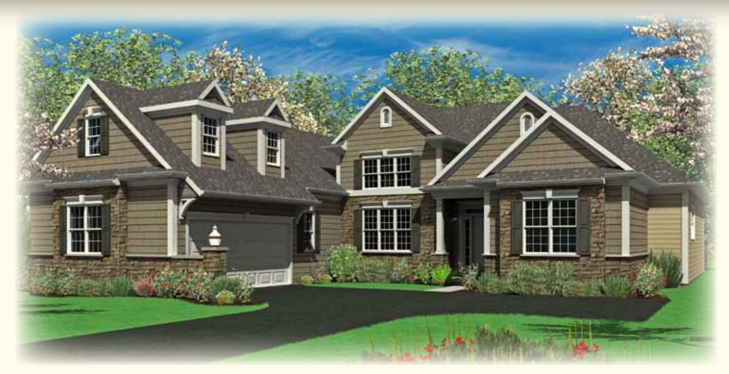
Elevation C TY-C-OR-1533

Shown with optional: 9 foot ceilings, transom above front door, cedar siding ILO standard siding (front of home only), courtyard wall W/ light, extended shed roof W/ decorative brackets above garage door, unfinished bonus room above garage, garage gable window, 2 garage dormers