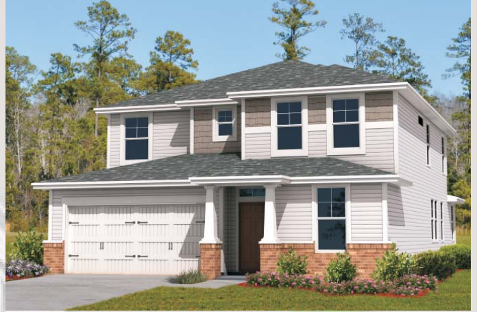
PRARIE - B