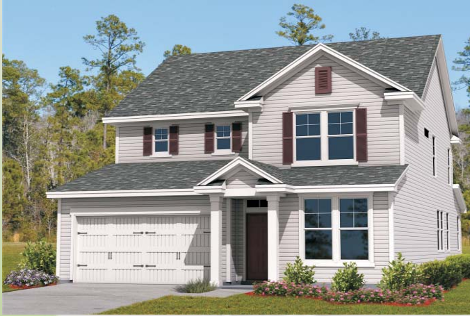
LOW COUNTRY - A