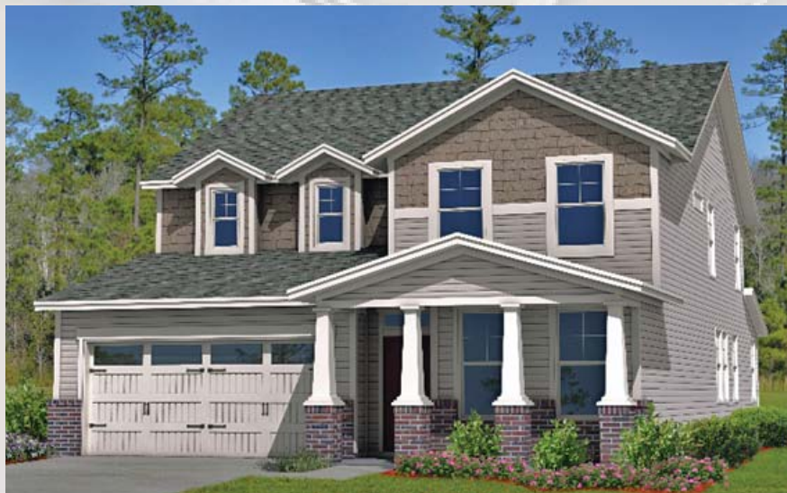
LUXURY - LE

LE elevation available in select Landmark 24 communities