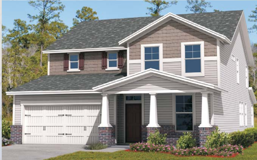
CRAFTSMAN - C