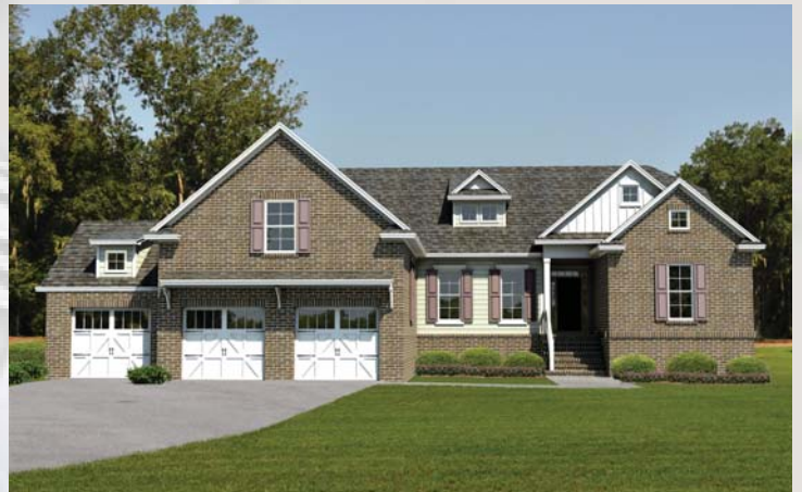
LE* Raised Elevation (w/ Optional 3rd Car Garage)

*LE Elevation available in select Landmark 24 Communities.