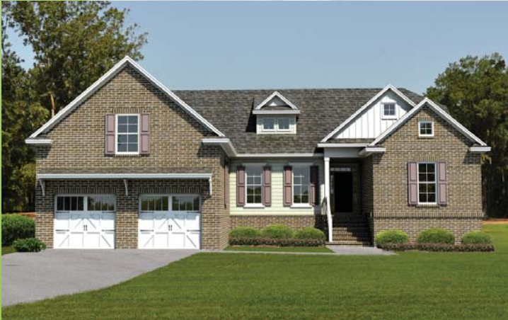
LE* Raised Elevation