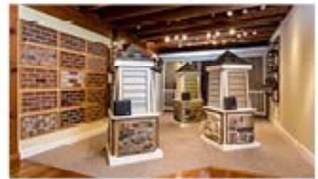
Katie Detwiler SELECTION GALLERY CONSULTANT